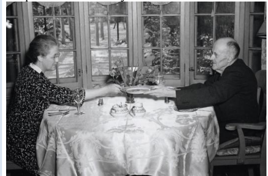
Paul and Jean at Home

Due to the death of his grandfather in the spring of 1888, he did not return to school in the fall. Harris soon moved to Des Moines, Iowa, where he was apprenticed at a local law firm. After completing his apprenticeship, he studied law at the University of Iowa. He graduated with a Bachelor of Laws in June 1891. However, for the next five years, he worked odd jobs: for a newspaper as a salesman and a reporter, on fruit farms, as an actor and cowboy, and on cattle ships that traveled to Europe. In 1896, Harris moved to Chicago, where he lived the rest of his life. It was in 1910 in Chicago that Harris married Jean Thomson, a Scotswoman whom he had met at a local nature club. Jean traveled the world with Harris in support of Rotary. She helped to make women an important part of Rotary, eventually leading to all Rotary Clubs admitting women. The couple never had any children.