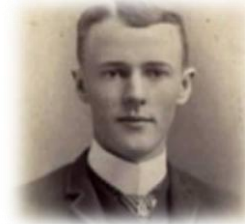
Paul Harris as a student at the University of Vermont